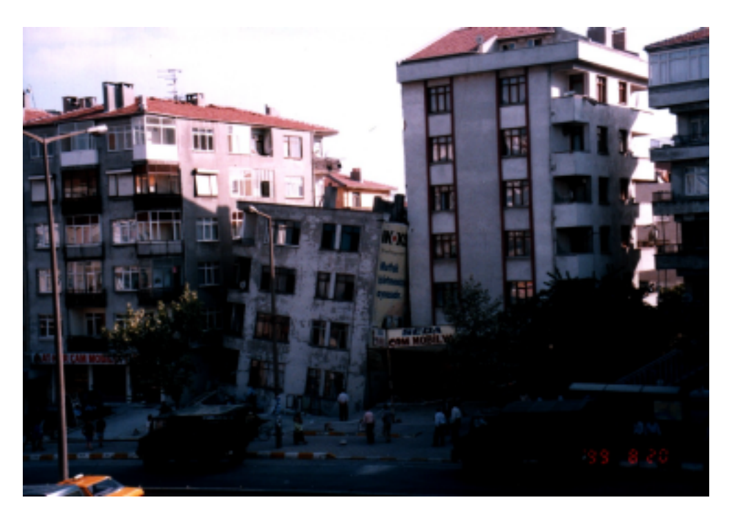
Figure 9.4 Collapsed 5 story RC building in Avc lar ( stanbul)