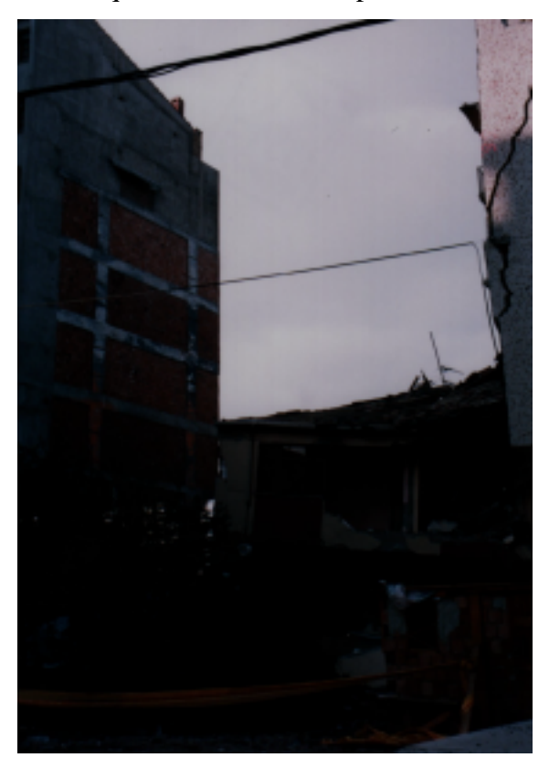
Figure 9.6 Collapse of 6 story RC building due to collision with a adjacent 8 story RC building in Avc lar ( stanbul)