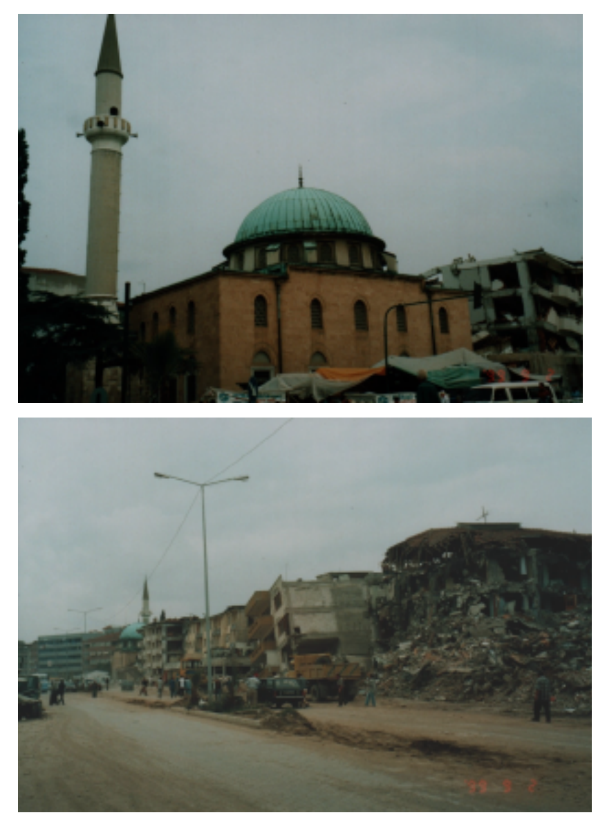
Figure 9.9 Views of Yeni Cami and its close vicinity in Adapazar

This type of structure is quite rare in the earthquake-affected area. During the site investigation, three such buildings were identified. One of them was Sapanca railway station and the other ones were Yeni Cami (mosque, built in 1946) in Adapazar and a mosque in Gölcük. None of these buildings were damaged. Particularly Yeni Cami was founded on alluvial deposits and was experienced also 1967 Mudurnu Suyu earthquake. Many modern reinforced concrete buildings next to this mosque were totally collapsed (Figure 9.9).