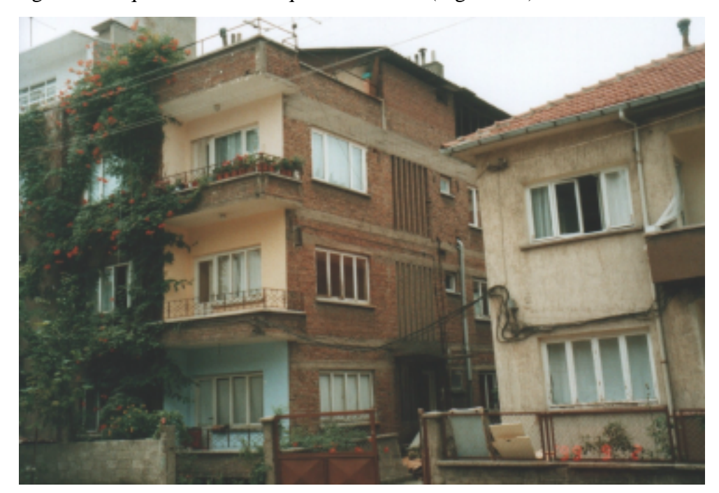
Figure 9.8 Non-damaged buildings made with solid bricks in T c lar district of Adapazar where liquefaction was widespread

The most severe damage was observed in houses made of delikli Tu la (hollow bricks). Although the use of this type of brick as a load bearing element was forbidden after the experience in 1992 Erzincan earthquake, its use is presently widespread in Turkey. It should be noted that this material is very brittle. Once it starts to fail, it fails very quickly as stress-concentrations develop everywhere. The houses made with solid bricks and reinforced with concrete slabs for the continuity of structures and having stories less than four performed very well during the earthquake even in a liquefied district (Figure 9.8).