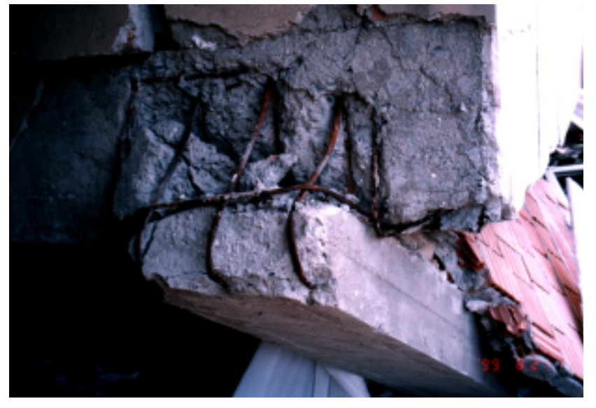
Figure 9.3 Improper column-beam connections (Note that reinforcing bars have smaller diameter and are not hooked with each other and lack of stir-ups and also lack of adherence of concrete. The building is shown in Figure 9.14