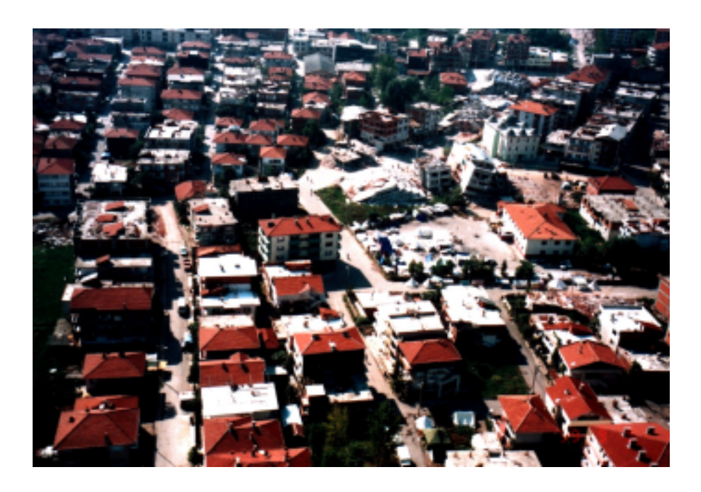
Figure 9.2 An aerial view of collapsed reinforced concrete buildings in Adapazar