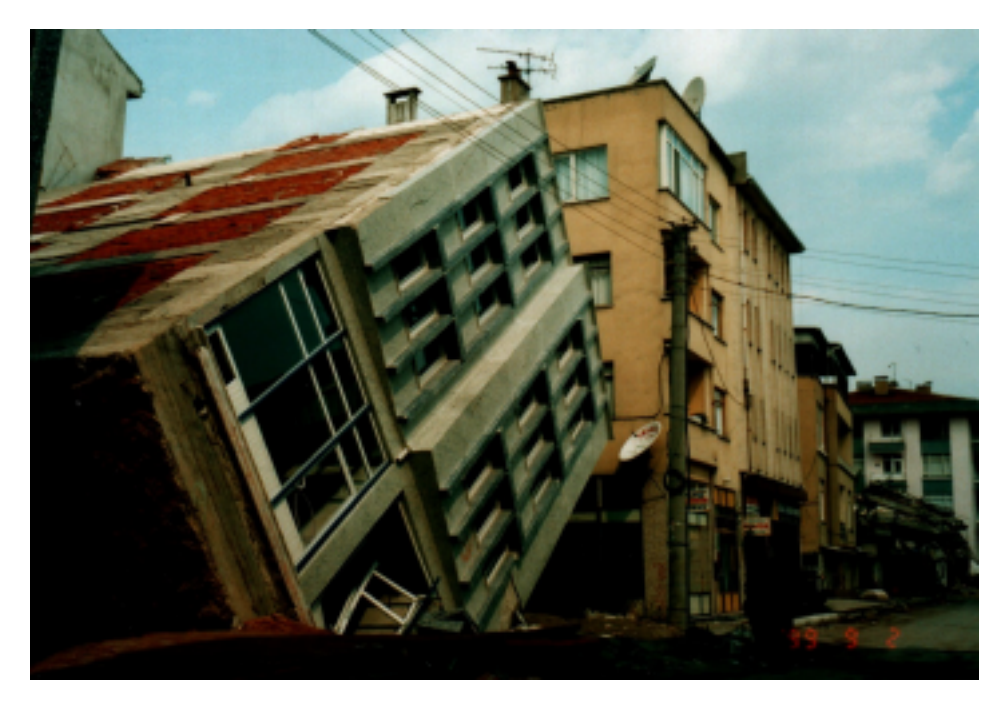
Figure 9.7 Toppled and collapsed buildings in T c lar district of Adapazar

Figure 9.6 Collapse of 6 story RC building due to collision with a adjacent 8 story RC building in Avc lar ( stanbul)